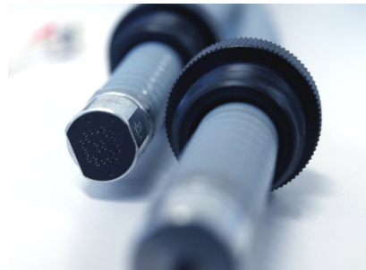
Fiber Optic Sensor

» Product Realization and Project Cockpit