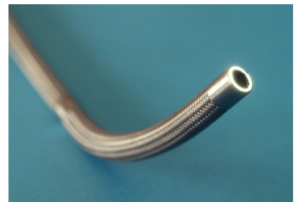
Chip on the Tip